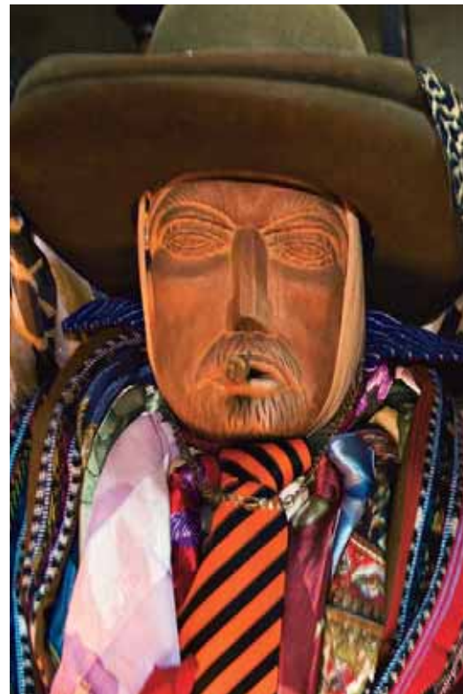
In Santiago Atitlán, the wooden statue of Maximón sports two cowboy hats, colorful scarves, and a cigar. He is both saint and devil, a mixture of Christianity and old Maya traditions.

Chajul sits on a series of ridgetops, a cocoon of winding dirt streets and beautiful adobe houses, wood smoke pouring through their tile roofs. Donkeys amble through the